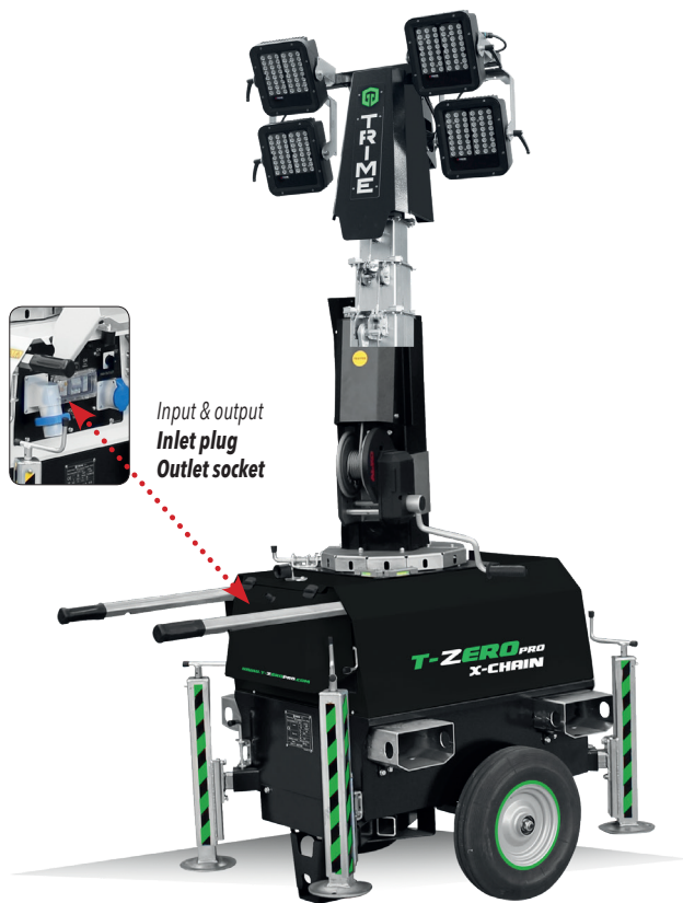
Input & output Inlet plug Outlet socket